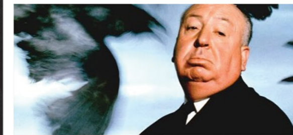
Learn more at WhidbeyIslandFilmFestival.org