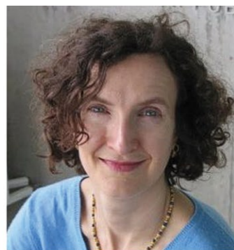
Learn more at WICAonline.org